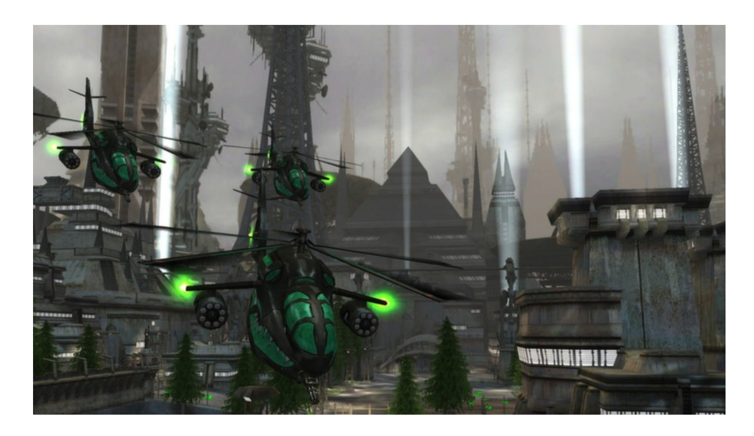
Jack-In-A-Castle Ativador Download [key Serial Number]

Download ->->-> <u>http://bit.ly/2NHaHtv</u>